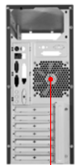
Rear Fan: 80x80 mm x 1 or 92x92 mm x 1