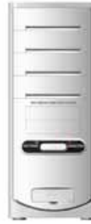
CX-1767-01 (Cool Gray)