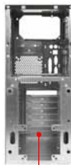
Front Fan: 80x80 mm x 1 or 92x92 mm x 1